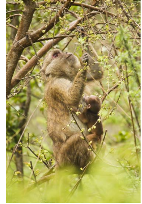
Arunachal Macaque Macaca munzala