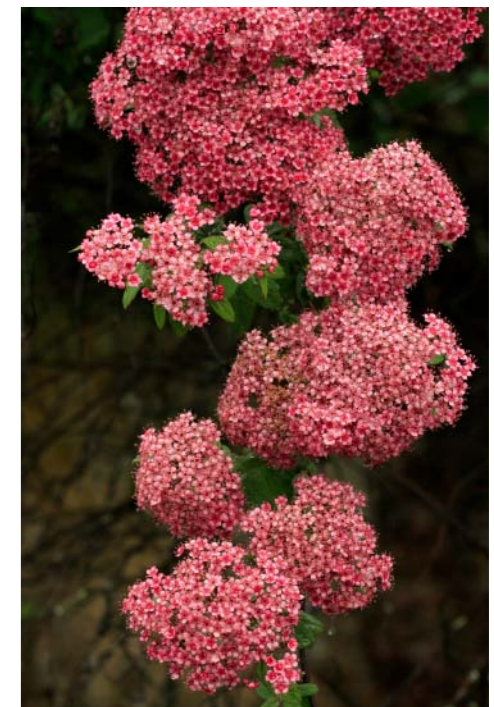
Pretty Spiraea Spiraea bella

Front Cover: Lake Gurudongmar, Sikkim Red Panda Ailurus fulgens Konyak Naga, Arunachal Pradesh Atlas Moth Archaeoattacus edwardsii Flower Rhododendron hodgsonii Green Magpie Cissa chinensis